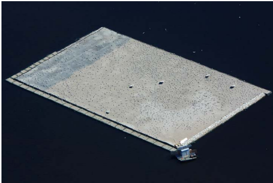
Overhead view of floating island -- Sheepy Lake, California