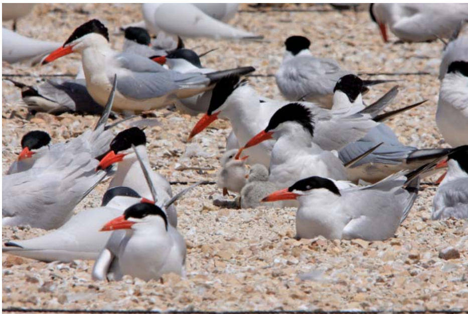
Caspian terns and fledglings -- Sheepy Lake, California

For more information on these floating island systems, contact Laddie Flock at laddie@floatingislandswest.com or 866-798-7086.