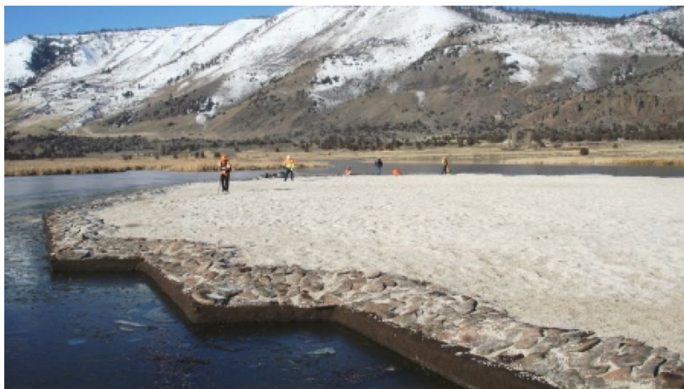
Completing the floating island at Dutchy Lake, Oregon

2010 was a very poor nesting season for Caspian terns in interior Oregon and northeastern California. Small numbers of breeding terns and low nesting success was widespread, but the Sheepy Lake floating island colony was a notable exception.