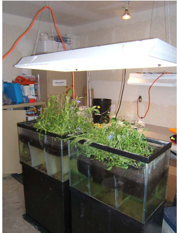
Floating treatment wetlands used in Conditions 3 and 4