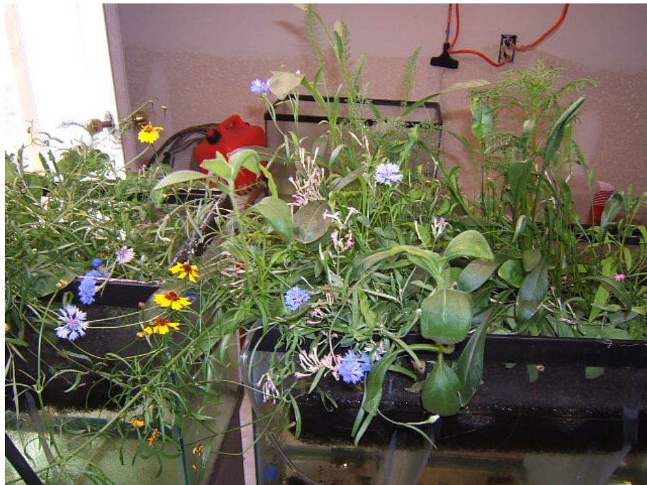
Floating treatment wetlands