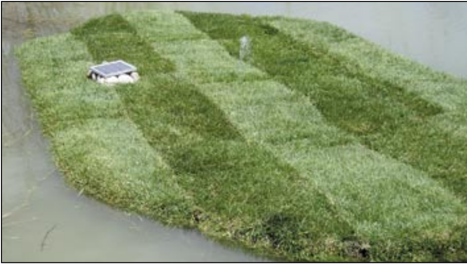
Imagine looking on your pond and seeing turfgrass growing in the middle. One enterprising pondmeister bought an island, sodded it, and drives golf balls toward it. Why?