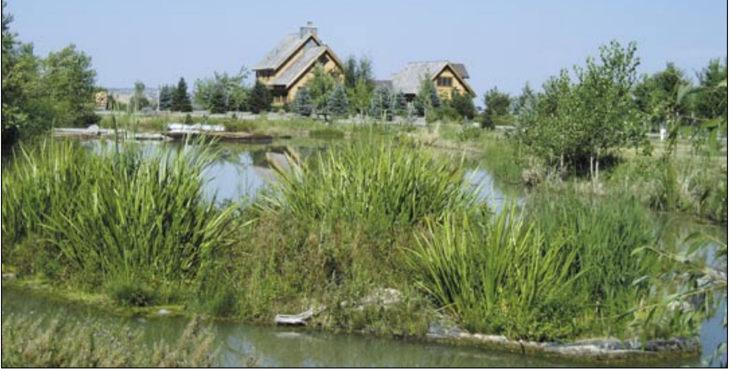
Above. This decorative floating island has been planted with a variety of shoreline and bog plants. Right. This floating island has been planted with a variety of native plants. It covers approximately 250 square feet.

humans are pretty arrogant to believe we can have a rapid influence on the climate. With that, he pulled out a plastic bookstore bag, handed me a brand new book called, “The Weather Makers” and made it mandatory reading. He explained, “As editor of a magazine, you have influence. Your thoughts are important. I think you should educate yourself about global warming.” The calm, conservative republican inside of me remained skeptical. The screaming scientist inside said, “Read the book.” Then, go find another book, and read it. Then, ask questions of knowledgeable people and report the findings.