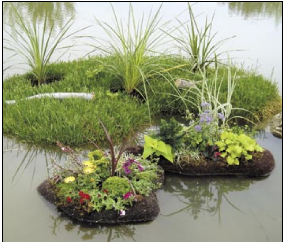
Three different islands, attached with cables and anchored, decorated.