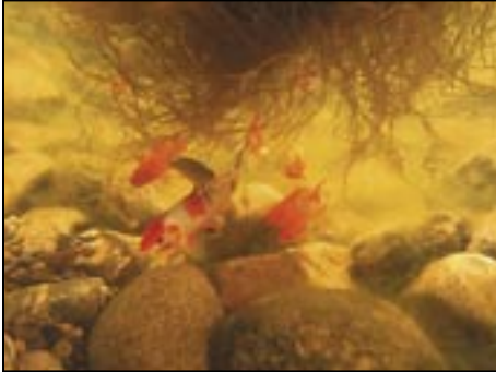
Top. Here's a small island, designed for backyard water gardens. Notice the goldfish underneath, nibbling on root mass. Bottom. An underwater shot of goldfish hiding underneath a small island.