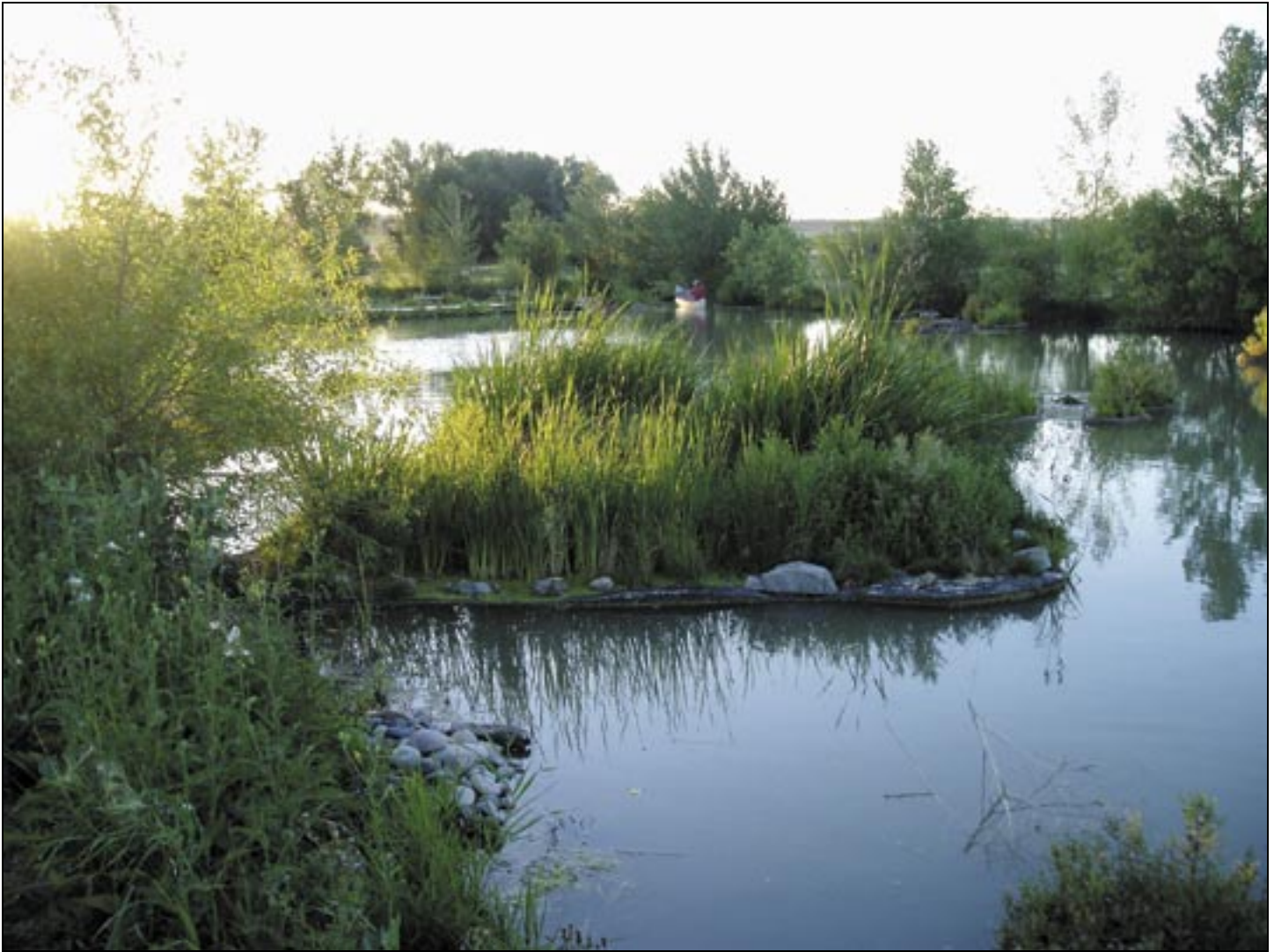
Another example of a floating island. This one is used for vertical landscaping with native plants.

manufactured floating islands is to take the best from what nature has done, copy it and make it available to those who need and want it.